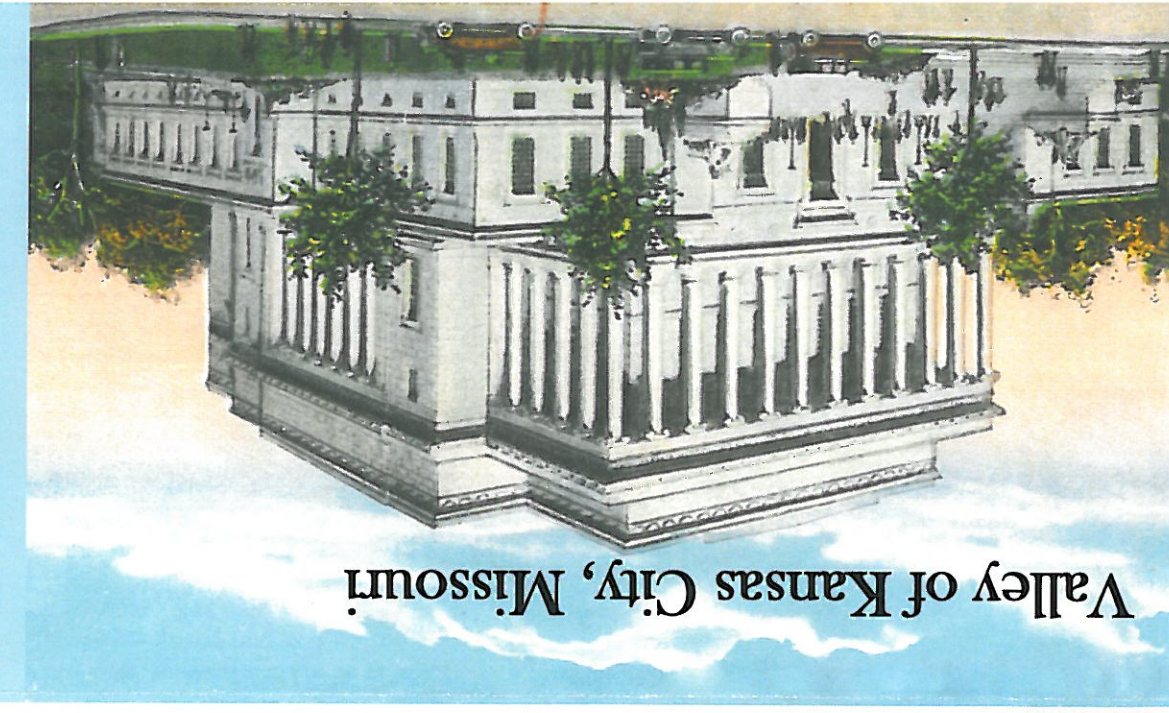
Valley of Kansas City, Missouri.